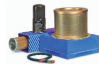
Strong After Sales Support